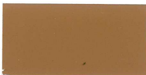
TAN 1 BAG PER YARD 3

The colors on this color chart approximate laboratory samples of troweled concrete made from a 6-sack mix, using Type II Gray Portland Cement (see base color sample), Silica Sand, and water to achieve a 4 inch slump. Different colors in cement, as well as some sands and water content will result in different colors.