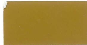
HARVEST GOLD 2 BAGS OF BUFF EQUALS 1 YARD 3 OF HARVEST GOLD