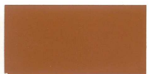
SALMON 3 BAGS OF TAN EQUALS 1 YARD 3 OF SALMON