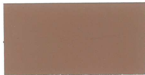
MAUVE 1 BAG PER 2 YARDS 3