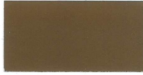
BUCKSKIN 2 BAGS OF EARTHEN EQUALS 1 YARD 3 OF BUCKSKIN