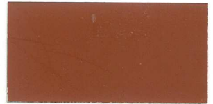
CAYENNE 3 BAGS OF MAUVE EQUALS 1 YARD 3 OF CAYENNE