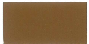
MOROCCAN TAN 3 BAGS OF SAND EQUALS 1 YARD 3 OF MOROCCAN TAN