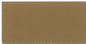
DESERT SAND 1 BAG SAND EQUALS 1 YARD 3 OF DESERT SAND