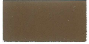
LEATHER 3 BAGS OF EARTHEN EQUALS 1 YARD 3 OF LEATHER