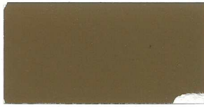
RAWHIDE 1 BAG OF EARTHEN EQUALS 1 YARD 3 OF RAWHIDE