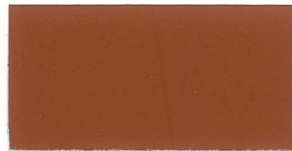
CLARET 2 BAGS OF MAUVE EQUALS 1 YARD 3 OF CLARET