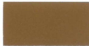
PINE CONE 2 BAGS OF SAND EQUALS 1 YARD 3 OF PINE CONE