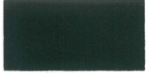
STORM GRAY 3 BAGS OF SLATE EQUALS 1 YARD 3 OF STORM GRAY