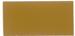
GOLDENROD 3 BAGS OF BUFF EQUALS 1 YARD 3 OF GOLDENROD