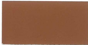
GUAVA 1 BAG MAUVE EQUALS 1 YARD 3 OF GUAVA